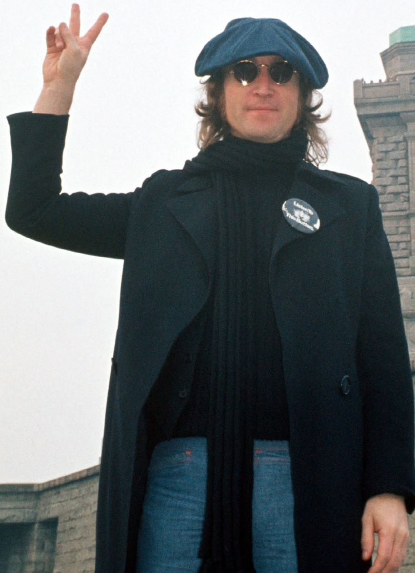
John Lennon at the Statue of Liberty, October 30, 1974.

The program is designed as a vehicle for self-reflection, self-expression, group discussion and fruitful collaboration, supporting goals for Social Emotional Learning (SEL) through a shared creative experience.