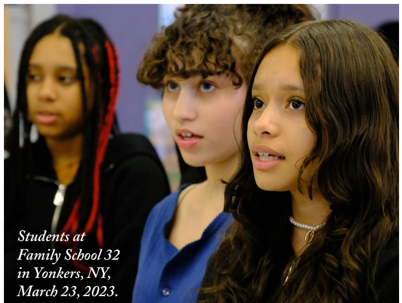
Students at Family School 32 in Yonkers, NY, March 23, 2023.